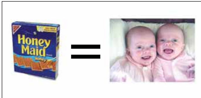
The above diagram was shown on page 69 of the Twin Report, and was passed out to numerous media outlets at Lavigna's press conference.