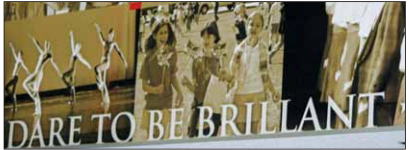
When the mural in the Roy Disney Pavilion was installed on Wednesday, October 6, two days prior to Founder's Day, it showed the school's new motto: Dare to be brilliant.