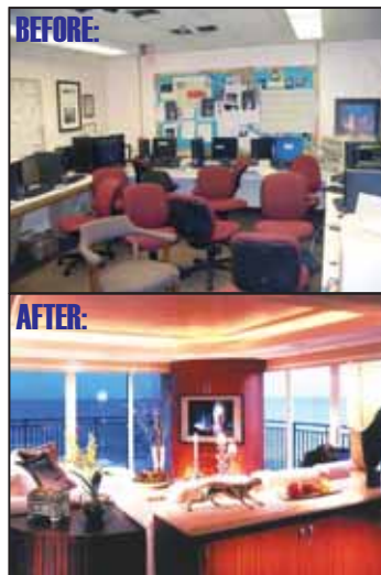
Above: the old journalism room; Below: the PiMped cLaSsRoOm